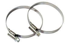
2x metal rings